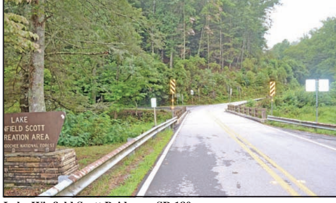
Lake Winfield Scott Bridge on SR 180

"We understand this is a significant inconvenience for our local community and visitors, and we are working closely with the Georgia Department of Transportation and our local emergency